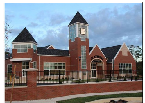
The new library opened on October 26, 2013

Don't miss your chance to contribute and become a permanent part of our community's history!